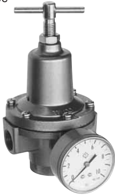
GAUGE ON OPTION