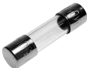
Glass Fuses - Quick Blow / Time Delay