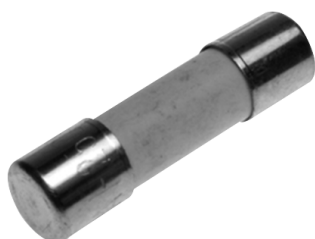
Ceramic Fuses - Quick Blow / Time Delay